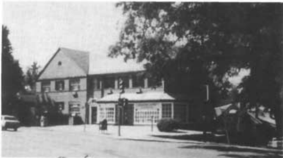
New Grand Lodge Building

In an informal ceremony on October 14, 1990, Grand Master Iversen dedicated the new Grand Lodge office building at 5428 MacArthur Boulevard, N.W., Washington, D.C.. Since leaving its quarters at 13th and H Streets, N.W. the Grand Lodge maintained an office in the Oriental Building Association building at 600 F Street, N.W. The new building was purchased in 1988, renovated as an office, library and museum, and occupied in May, 1990, prior to the dedication ceremony in October. Its splendid appointments make this new home for the Grand Lodge a most comfortable place to conduct its affairs for the foreseeable future.