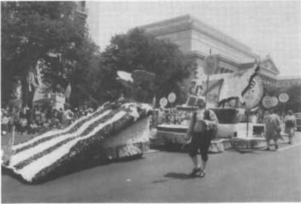
Grand Lodge float in the Independence Day Parade in Washington, D.C. on July 4, 1988.