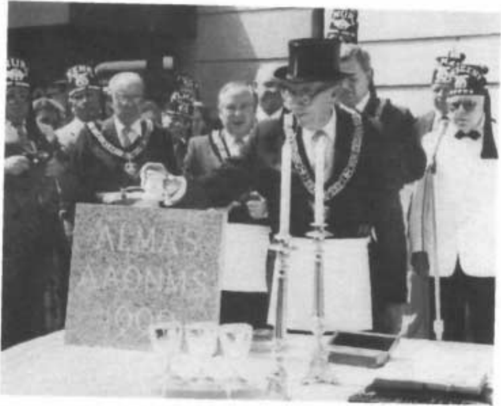
Laying of the Cornerstone of Almas Temple, A.A.O.N.M.S.

Potentates of Almas Temple. During the ceremony a commemorative box containing many artifacts was deposited in the cornerstone. An interesting sidelight to this event was the fact that the Grand Master was also a Past Potentate of Almas Temple.