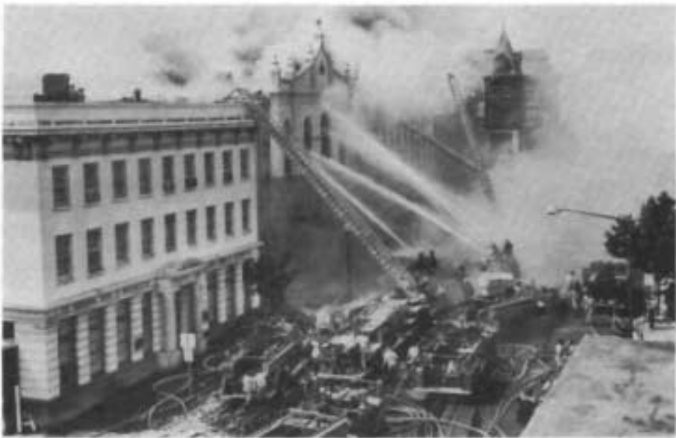
Fire destroyed Potomac Lodge Hall on July 7, 1963

In a very impressive ceremony the Grand Master presided over the dedication of the new Lodge Hall of Anacostia Lodge No. 21.